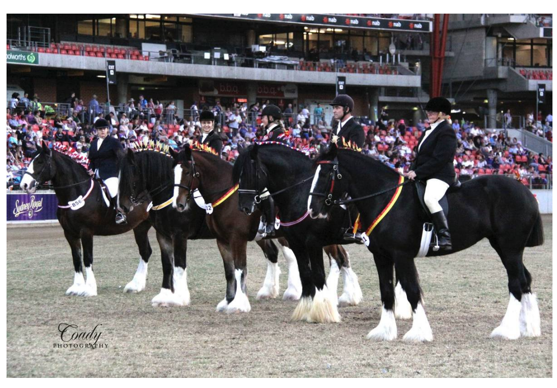
2009 Sydney Royal Easter Show Ridden Shire Class