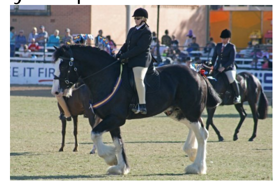
Southern Cross Spitfire under saddle