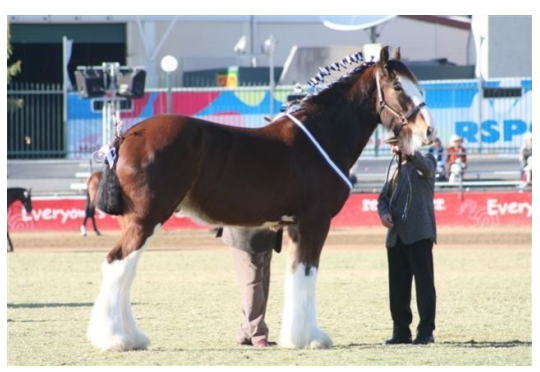
Ingleside Bright Spark, Champion Shire

The Ekka has announced they will be holding Shire Classes again in 2010, and after further discussions with SHSA have agreed to update the program to accommodate young horses and to fix an obvious loophole in the Ridden Heavy Horse rules that allowed light horses to enter this year.