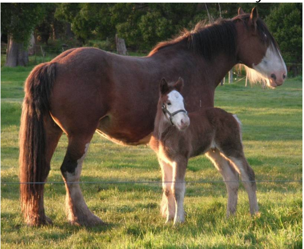
Reg Bay shire gelding, DOB 22/09/09. White face, 4 x Stockings, Sweet nature, Started basic handling. $3800

Contact Brooke – 0438 727 317 or 03 6394 7070 brook.blundstone@bigpond.com