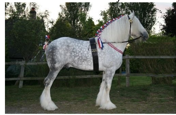
Imported from the UK Grey Shire, born 2003, Premium, 18.2hh Cost:

Frozen semen for sale – Grey Shire Goose Green John Wesley